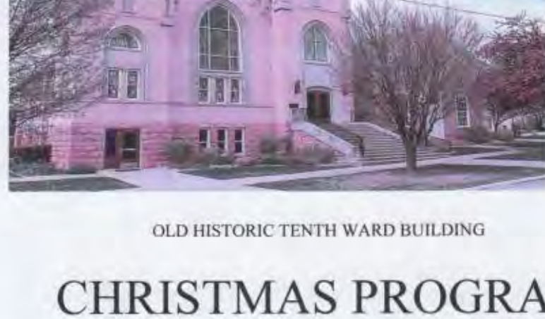
OLD HISTORIC TENTH WARD BUILDING

Please Note: This is a "Date" Change Normally we meet on the First Thursday The Choir Director requested the day change.