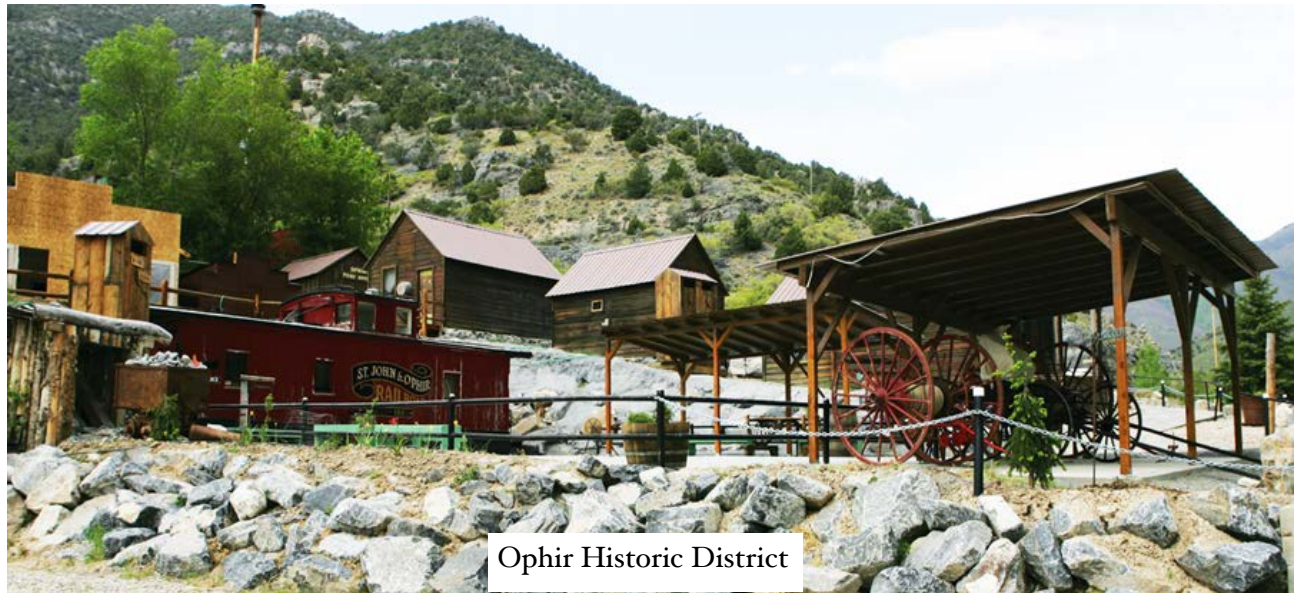
Ophir Historic District