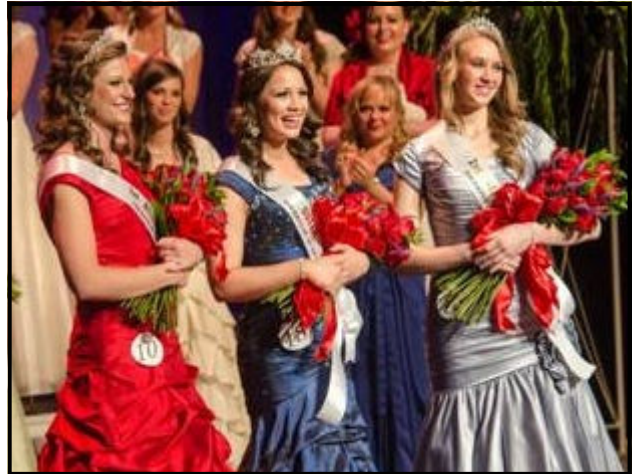
Days of 47 Royalty